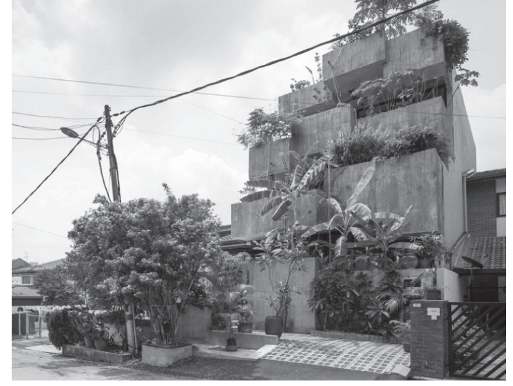
Planter Box House

The Awards this year saw a total of 136 valid submissions and 32 entries shortlisted for final judging.