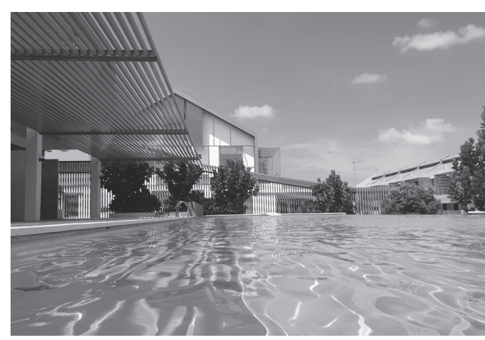
Precint Luxe @ La Promenade by Design Network Architects.